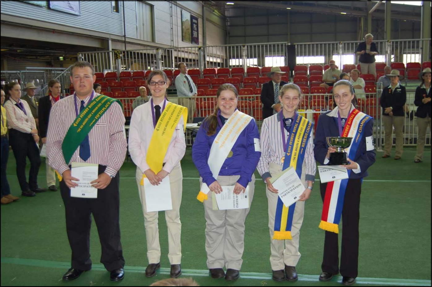
Above: RAS NSW State Finalists