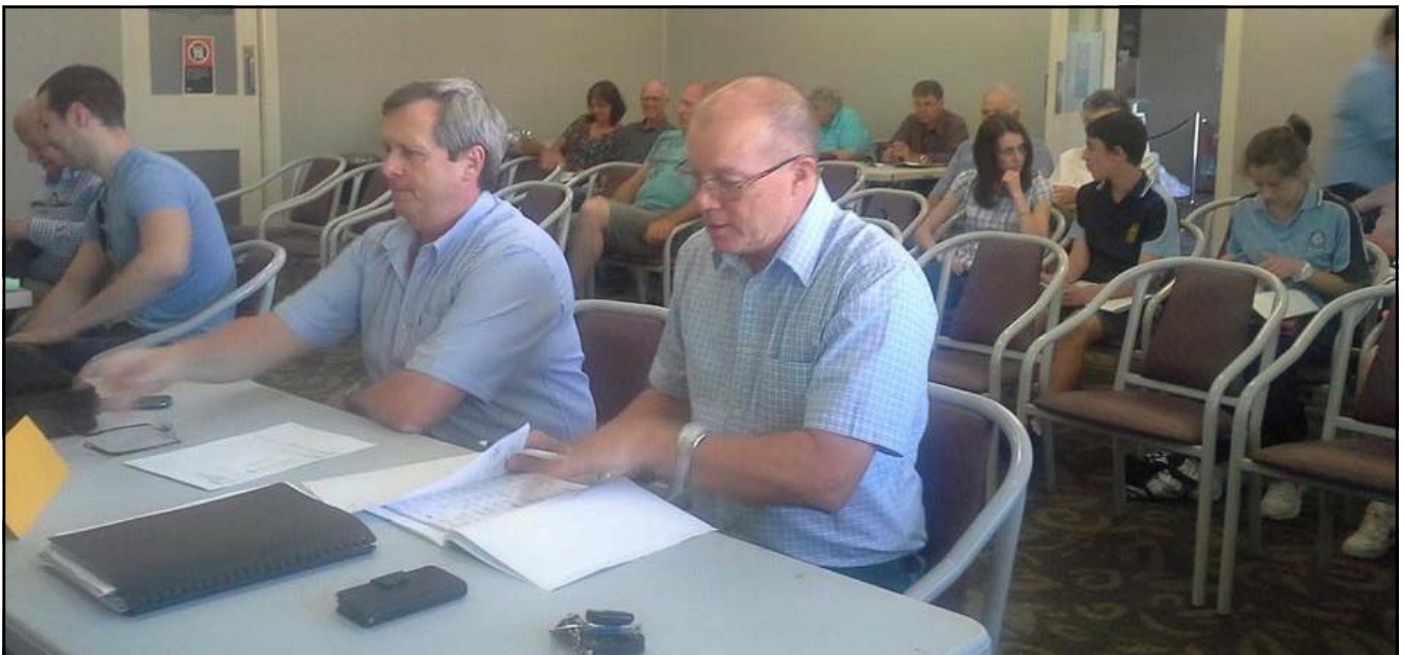
Some of the buyers and part of the large crowd at our November Auction.