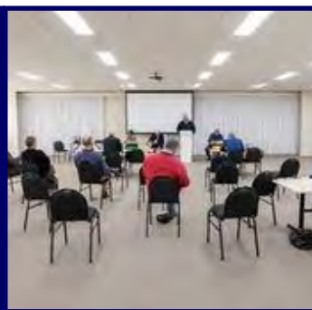
Auction in full swing.